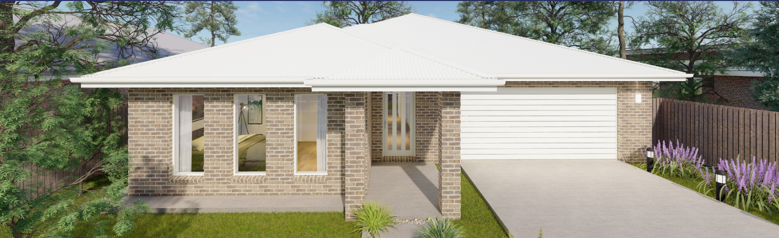
STANDARD RENDER | Renders are for indicative purposes only and standard façade is included in base price.